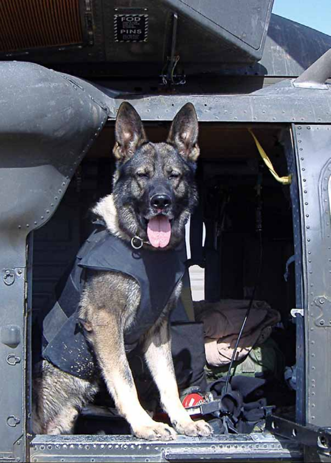
Argo a military working dog keeping watch over "his bird" in Iraq, 2009.