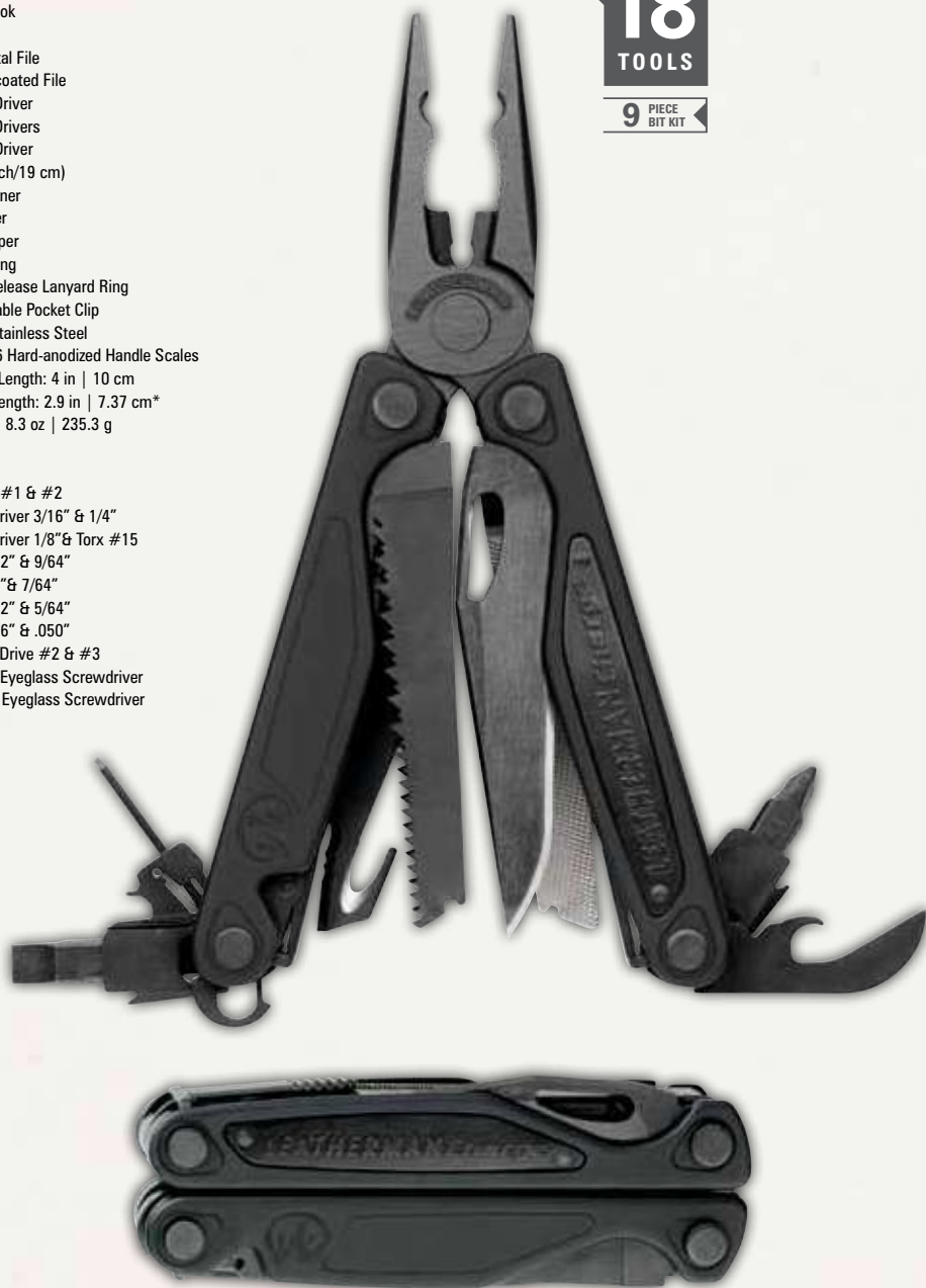
*Primary Knife Blade