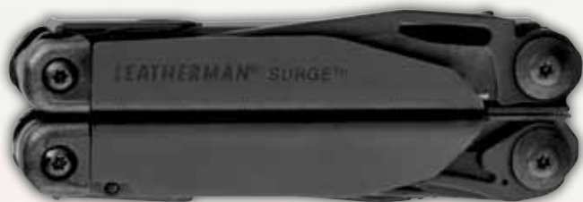
*Primary Knife Blade